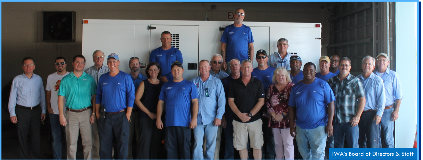
IWA's Board of Directors & Staff

The Island Water Association's Quarterly Newsletter