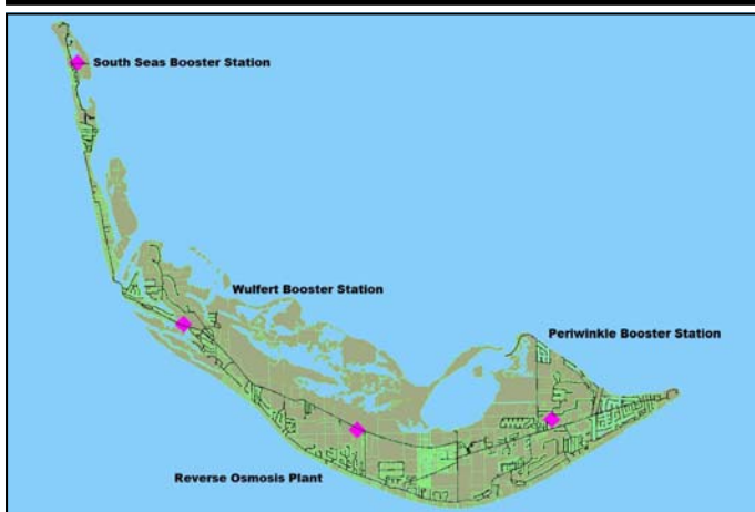
IWA Booster Storage Tank Locations

During the months of May through July, all three of IWA's booster station storage tanks were