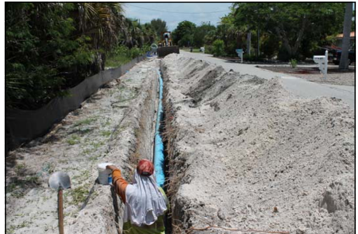
New Piping Being Installed in Lake Murex

Work began on the replacement of water mains, fire hydrants, and service connections in the Lake Murex subdivision in early June. This subdivision was prone to repeated leaks and repairs due to the installation of thin wall Class 160 plastic pipe, iron saddles, and PVC service lines by the original contractor. This was the norm at the time Lake Murex was built. Today we use C900 PVC pipe, with a wall thickness almost double that of Class 160, and stainless steel saddles to connect poly tube service lines to members' water meters. Eleven new fire hydrants, for a total of twenty,