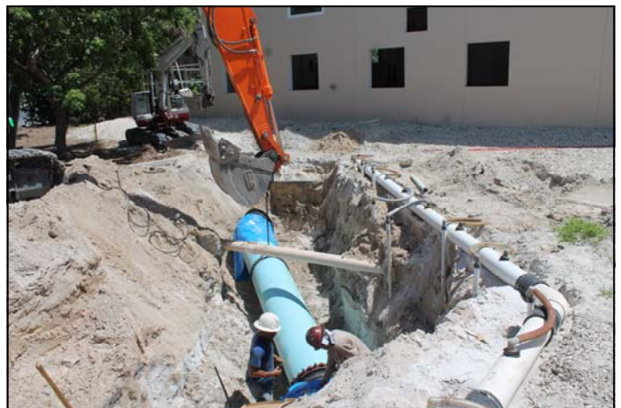
New Piping from the Storage Tanks to the New Pump House

The underground piping that will connect the new distribution pumps in our new High Service building to the storage tanks and to the distribution system was started in early July. The three pumps and motors were also delivered in July, so work continues to get our new distribution pumping station up and running. The contractor for this portion of the project, Strickler Brothers Underground, had many obstacles to overcome as they installed the new 20" suction pipe run to the new building. Existing piping, consisting of water, drainage, and electrical, had to be negotiated over and under very carefully. They performed this task flawlessly, with no damage to existing infrastructure. They will now begin installing pipe to the new pumps, working their way out of the building to the underground piping.