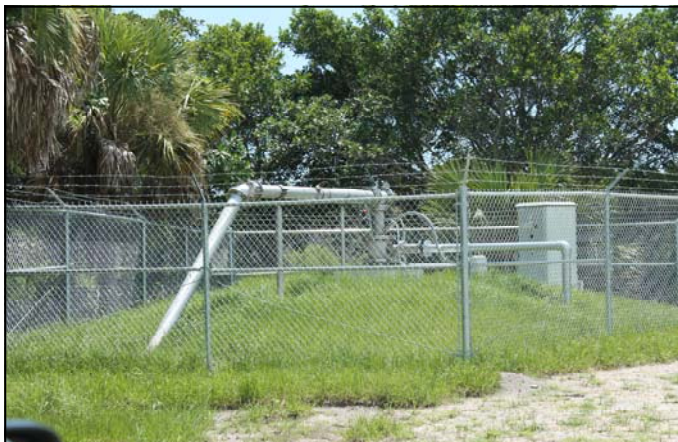
Suwannee Well #9

The new Suwannee well is complete. Capacity of this well is about double that of the well that was replaced at this site (Hawthorn 13). The fence has been installed around the facility and approval from the Lee County Health Department and the South Florida Water Management has been obtained. The well, designated Suwannee 9, is now part of our network of fifteen production wells, comprised of eight Suwannee Aquifer wells and seven Hawthorn Aquifer wells. This project finished 25% under budget.