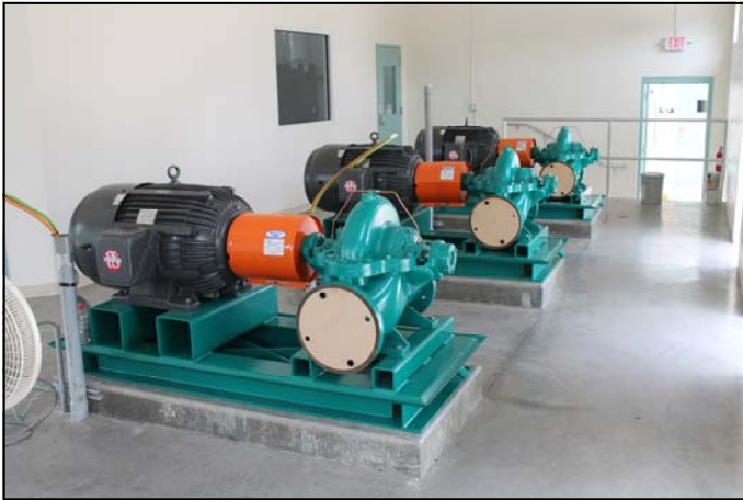
New Distribution Pumps and Motors